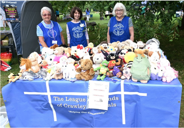
League of Friends of Crawley Hospital

We all had such a great time at Show Time Again! Our committee would like to thank all performers, stall-holders and volunteers as well as everyone who attended for making the day extra special!