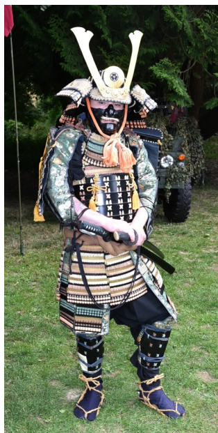
Shin Sei Dojo