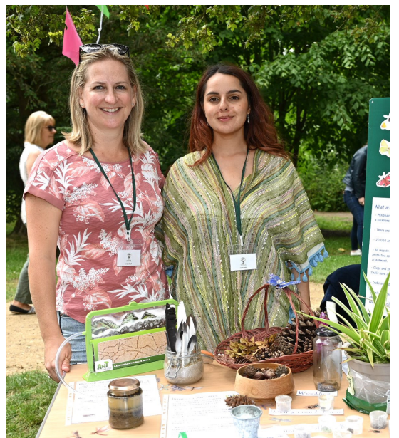
Friends of Goffs Park Explorers' Nature Table