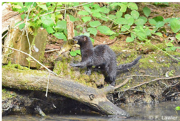
American Mink, Neogale vison