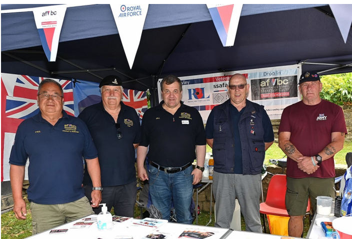
Crawley and Horsham Armed Forces and Veterans Breakfast Club (AFVBC)