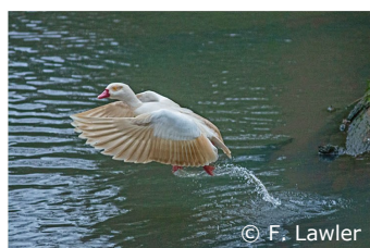
^ Egyptian Goose, Alopochen aegyptiaca acris