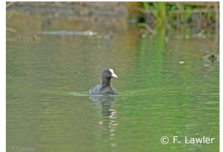
Coot, Fulica atra

Follow Frank : https://www.flickr.com/photos/155787248@N08/