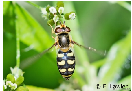
Hoverfly, Eupeodes volucris