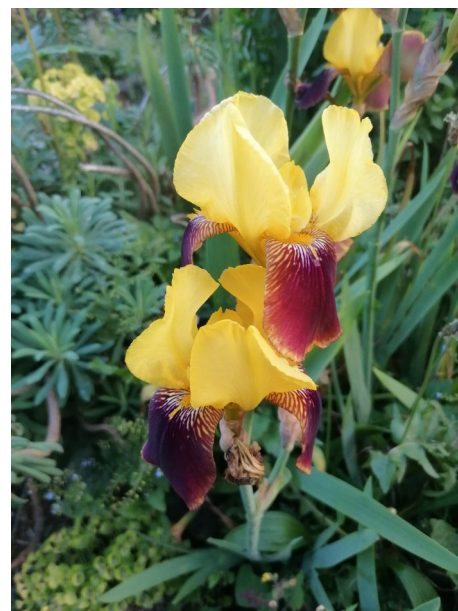
Yellow irises outside Goffs Park House during May

As always, we're grateful for the continued support of all members and by all means feel free to get in touch! We always welcome new members.