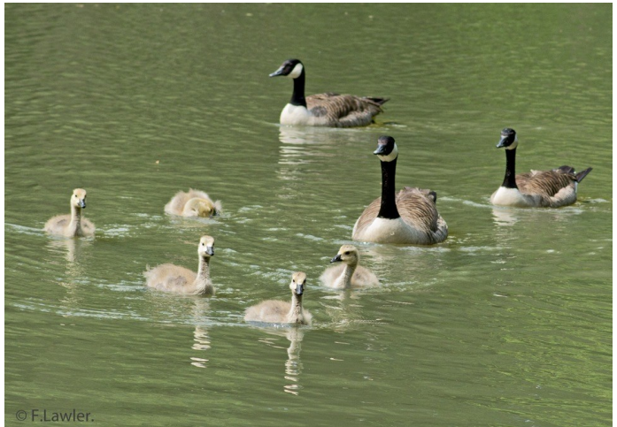
Canada geese, Branta canadensis