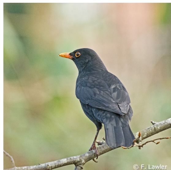
Common blackbird, Turdus merula

Follow Frank on Instagram: @gooffs_park_wildlife