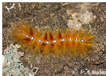
Sycamore moth caterpillar, Acrionicta aceris