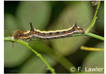
Grey dagger moth caterpillar, Acrionicta psi

Follow Frank on Instagram: @gooffs_park_wildlife