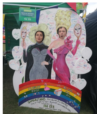
Samaritans stand, Crawley Pride