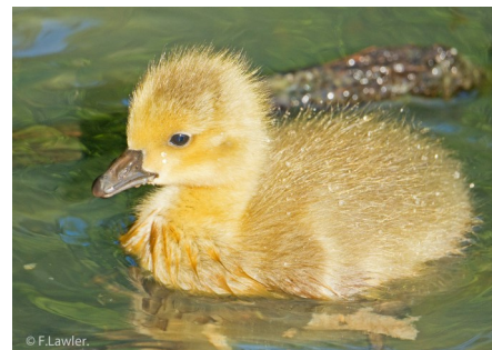
Canada Gosling, Goffs Park pond

Finally, a big thankyou for the continued support from all, as we look to plan events for the year ahead.