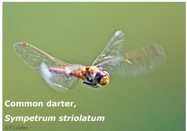
Common darter, Sympetrum striolatum