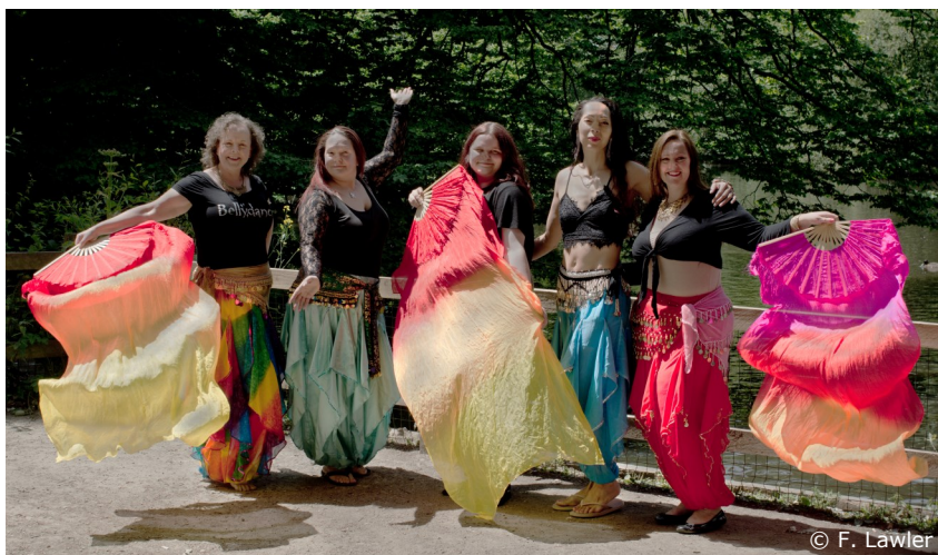
Crawley Belly Dancers at Show Time in Goffs Park