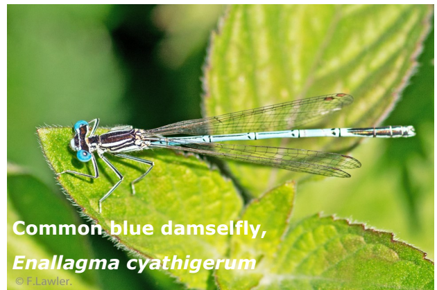
Common blue damselfly, Enallagma cyathigerum

The Common darter is a red narrow-bodied dragonfly which hovers, before suddenly darting towards their insect-prey.*