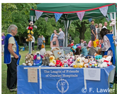
League of Friends of Crawley Hospital and Kendo at Show Time